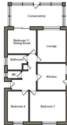
Floorplan is indicative of layout only and should not be used for accurate measurement or structural purposes.